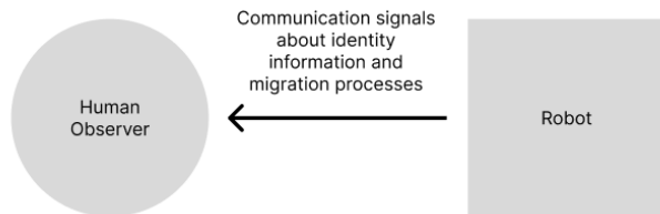
Fig. 1. Signals are intentional communications.

This paper reviews the current body of literature, identifies challenges and opportunities to address this gap. It investigates a robot “mind transfer” between both embodied and non-embodied agents, enabling the creation of hybrid